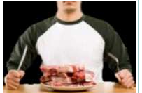
Men's Dinner Starts at 6:00pm

Bring your ideas and some money for your takeaway tea.