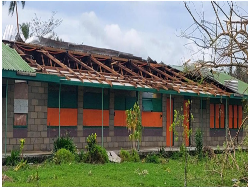
Onesua College Classroom roof destroyed by Cyclone Kevin in March

Category 4 Tropical Cyclones Judy and Kevin hit Vanuatu within 48 hours of each other on March 1 and 3 2023. The Presbyterian Church of Vanuatu has taken some time to gather information about damage to schools, churches and other property as a result of these cyclones. Many roofs were ripped off and water damage was sustained as a result, along with other impacts. Due to the isolated nature of many of Vanuatu's islands it has not been easy getting all these details together. But information recently received has estimated that repairs to PCV property on several affected islands will cost at least NZD $320,000. Onesua Presbyterian College on Efate Island was assessed separately and needs extensive repairs. This has not yet been costed but will be high.