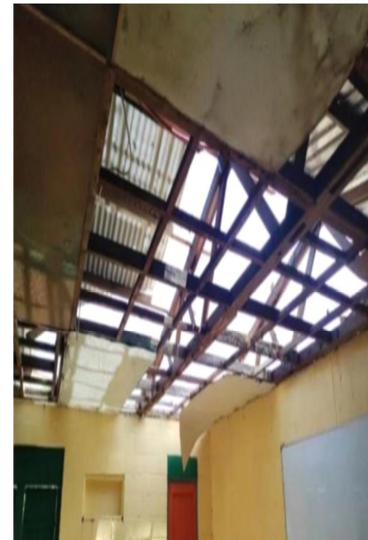
Onesua College - Damage to Junior Science Lab