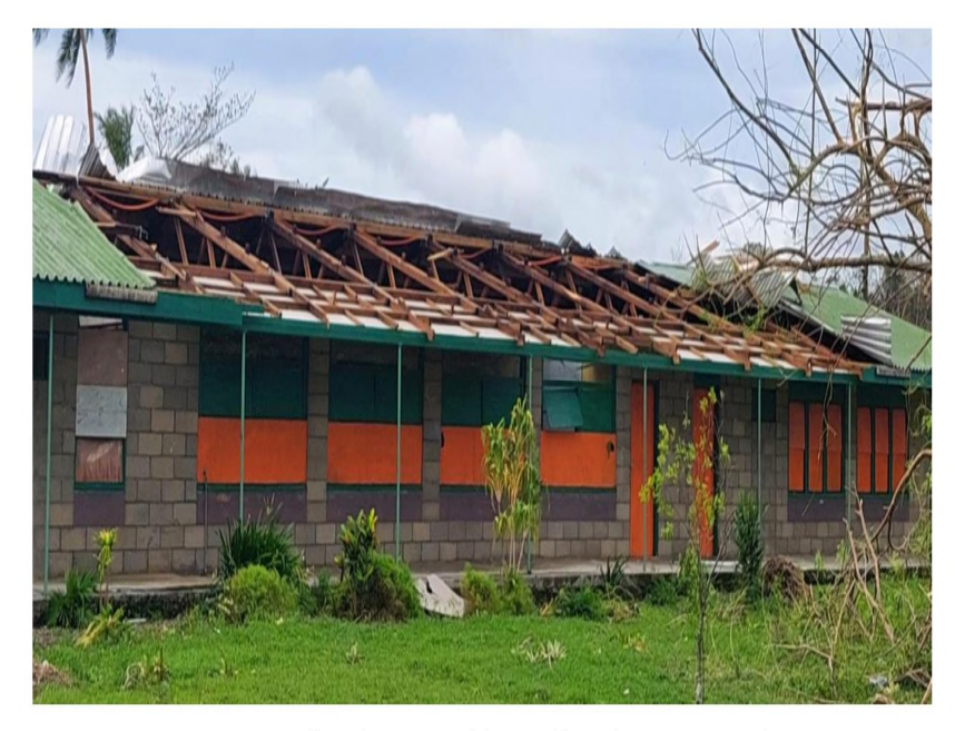
Onesua College Classroom roof destroyed by Cyclone Kevin in March

Category 4 Tropical Cyclones Judy and Kevin hit Vanuatu within 48 hours of each other on March 1 and 3 2023. The Presbyterian Church of Vanuatu has taken some time to gather information about damage to schools, churches and other property as a result of these cyclones. Many rooves were ripped off and water damage was sustained as a result, along with other impacts. Due to the isolated nature of many of Vanuatu's islands it has not been easy getting all these details together. But information recently received has estimated that repairs to PCV property on several affected islands will cost at least NZD $320,000. Onesua Presbyterian College on Efate Island was assessed separately and needs extensive repairs. This has not yet been costed but will be high.