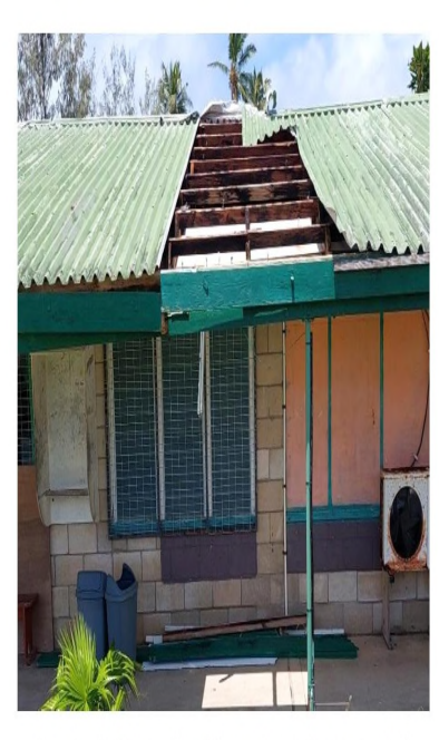
Onesua College - Roof Damage on Computer Lab

Session has approved a church donation of $2,000.00. If you wish to donate to this please either donate directly or tag it in an envelope or online and we will pass it on.