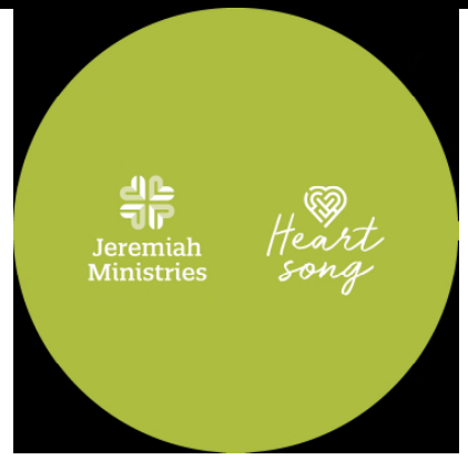
Sunday 20th August